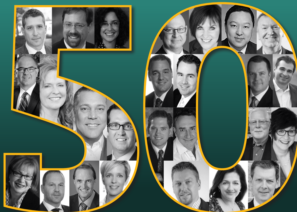
WP ranks Canada's top-performing advisors

Here it is – Canada's most comprehensive list of top-performing advisors. For two months this past fall, WP ran a survey asking Canadian advisors to submit basic data about their practices. We received hundreds of entries, and over the holidays, we crunched the numbers. The result is this: The second annual WP Top 50 Advisors list. Congratulations to those who've made the cut – it's by no means a small feat.